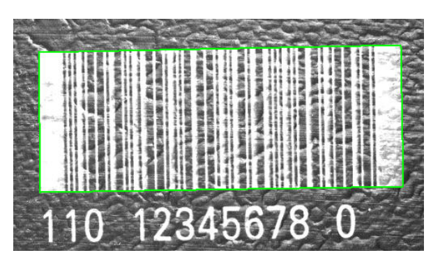
Recognition example: lasered barcode on plastic material